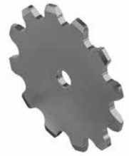
Plate wheel for chain conveyors